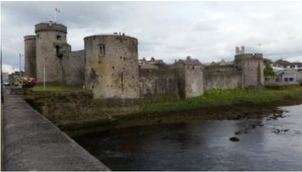
King John's Castle at Limerick