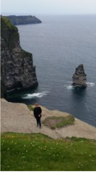
The cliffs of Mohar