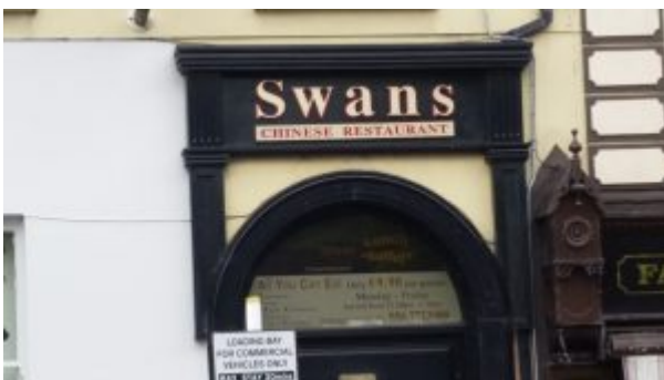
Irish or Chinese?