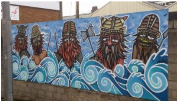
Vikings at Waterford